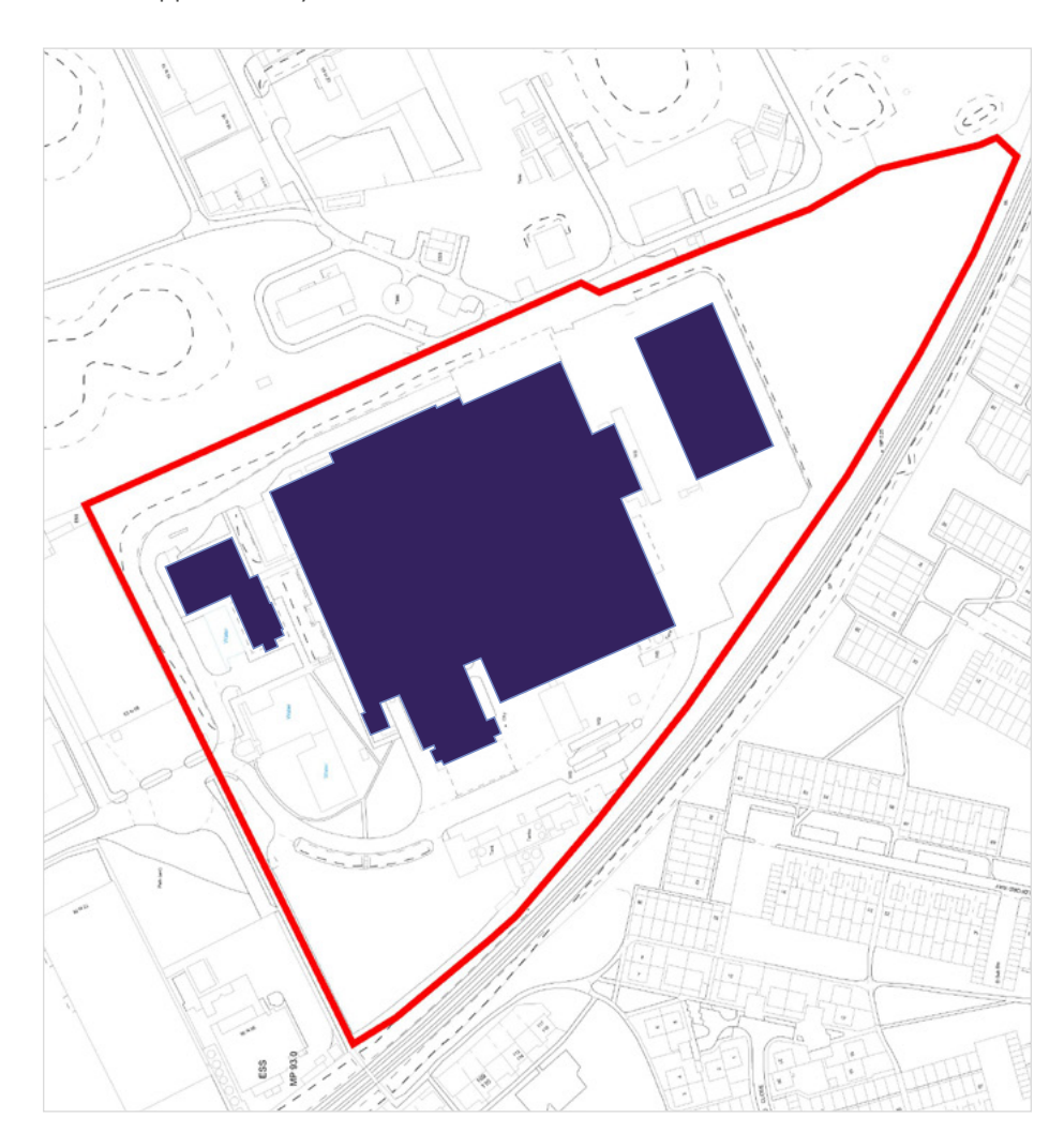
*for indicative purposes only

The site is well configured and extends to 16.91 acres, providing a low site cover of approximately 33%.